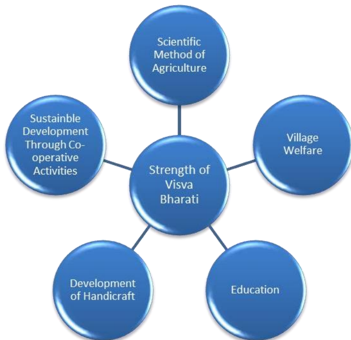
Strength of Visva-Bharati

The agricultural activities were based on three phases- (i) experiment; (ii) training, and (iii) extension. Extension activities were given much priority